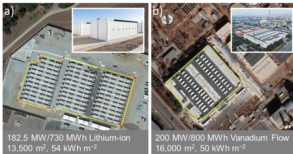
Fig. 2 Satellite images and photos of some of the largest battery energy storage systems deployed to date. (a) Lithium-ion batteries in Moss Landing, California: Elkhorn Battery, operated by Pacific Gas & Electric Company; 182.5 MW/730 MWh, 54 kWh m -2 . Map Data: Google, © 2022 AMBAG, Maxar Technologies, Photo adapted from ref. 42. (b) Vanadium flow battery in Dalian, China, by Dalian Rongke Power Co. Ltd; 100 MW/400 MWh, 25 kWh m -2 . A second phase of equal capacity in the same building is under construction, bringing the areal energy density to 50 kWh m -2 . Map Data: Google, © 2022 Maxar Technologies, Photo adapted from ref. 43.

that only two installations could be identified where LIB containers are stacked, resulting in 26–33 kWh m -2 . The average storage duration of the BESS examined here is 2.6 hours (Fig. S6a and Table S1, ESI † ). Most deployed systems to date are based on cells using nickel manganese cobalt oxide cathode materials, but manufacturers are shifting towards less energy-dense lithium iron phosphate due to improved cost and safety aspects. 38,41 We point out how much space is available around most large-scale LIB deployments, particularly near production facilities like solar farms (Fig. S18, S24 and S26, ESI † ), and how the excellent cell level energy density of LIBs is largely rendered irrelevant in this application.