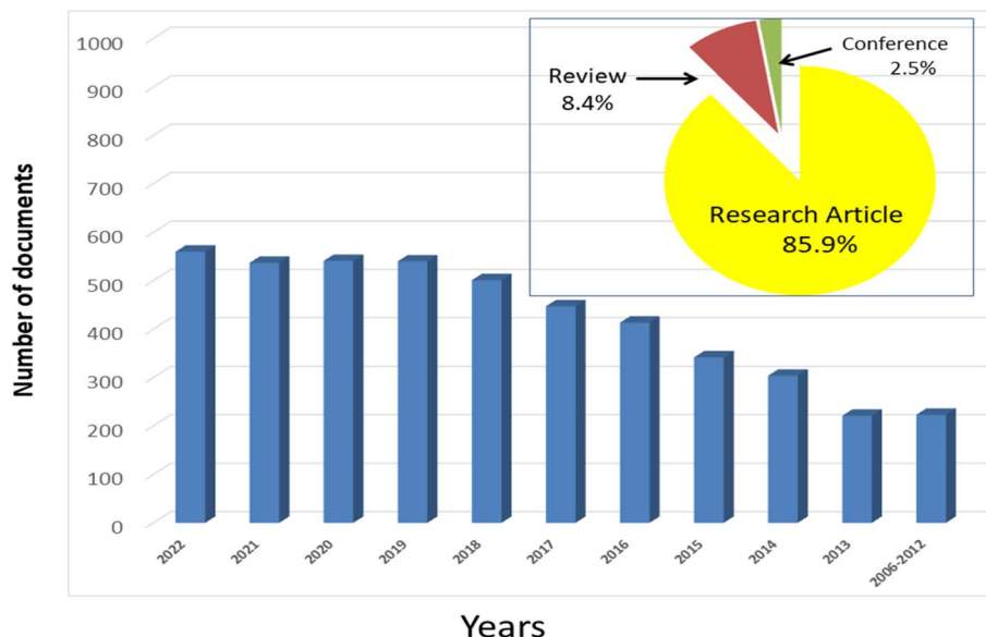
Fig. 1 Number of publications in Scopus database reporting graphene/semiconductors materials for photocatalytic reaction (keywords: graphene AND photocatalysis).

photocatalytic performance of graphene-based semiconductors for industrial applications. We believe this review will benefit researchers in the fields of photocatalysis, graphene and semiconductors-based nanomaterials.