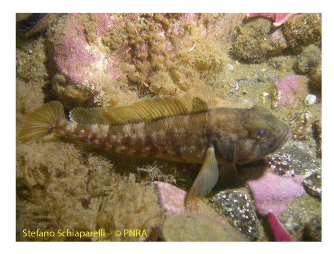
Fig. 3 A specimens of Trematomus bernacchi.

In order to compare with and complement observations in the Arctic, the following discussion focuses on POP temporal trends in marine fish and Adèlie penguins. These species are native to Antarctic marine environment and thus suitable to study temporal changes in contaminant exposure in this region. The Tables 1–4 report the concentrations of POPs in the most studied fish and penguin species. Among POPs, we selected PCBs, p,p'-DDT, p,p'-DDE, DDTs, and HCB since other chemicals, including emergent contaminants, were reported only in few articles.