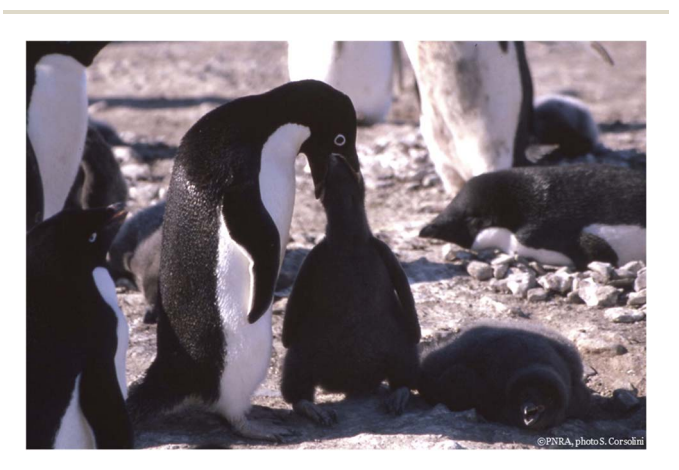
Fig. 2 An Adèlie penguin feeding its chick (©PNRA, photo S. Corsolini).

After the calving of the Nansen Ice Shelf (Ross Sea) in 2016, the foraging ground of Adèlie penguins (Fig. 2) changed and penguins fed in this newly accessible sea area.<sup>41</sup> A linkage between food item, ice coverage, foraging range, and POP contamination in Adèlie penguins from a rookery in the Ross Sea (Fig. 1) was already reported in the 1990s.<sup>44</sup> Here, a sequence of events occurred in the 1995/96 summer season: the ice melted completely very early in the season and penguins during the rearing chick period foraged nearer to the shore to save energy instead of swimming offshore for feeding on krill. The penguin diet during the rearing period is based on krill, which