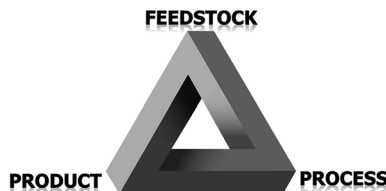
Fig. 1 Penrose triangle for a fossil-to-bio transition.

latest developments in science and technology that address those questions and challenges and create new opportunities.