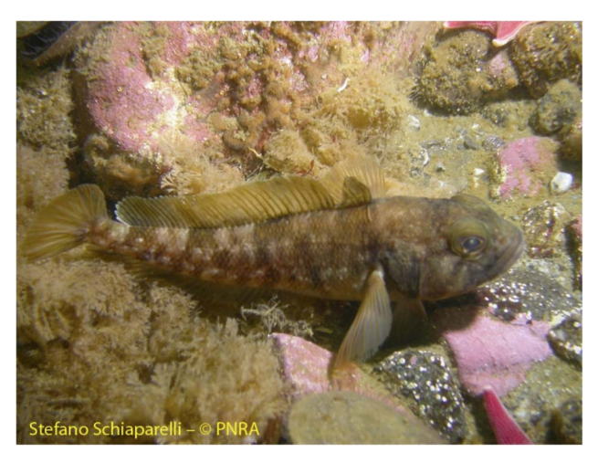
Fig. 3 A specimens of Trematomus bernacchi.

In order to compare with and complement observations in the Arctic, the following discussion focuses on POP temporal trends in marine fish and Adèlie penguins. These species are native to Antarctic marine environment and thus suitable to study temporal changes in contaminant exposure in this region. The Tables 1–4 report the concentrations of POPs in the most studied fish and penguin species. Among POPs, we selected PCBs, p_sp' -DDT, p_sp' -DDE, DDTs, and HCB since other chemicals, including emergent contaminants, were reported only in few articles.