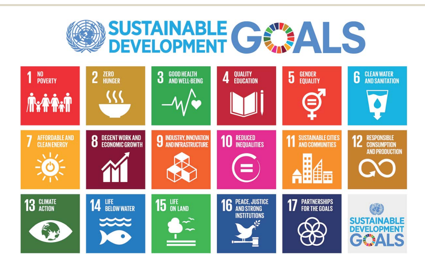
Fig. 1 The 17 SDGs of the UN, aimed at ending poverty, protecting the planet, and ensuring prosperity for all as part of the sustainable development agenda. Each goal has specific targets to be achieved over the period 2015–2030 (http://www.un.org/ sustainabledevelopment/sustainable-development-goals/). An 18<sup>th</sup> SDG aimed at clean air should be added.

It is proposed here to adopt an additional SDG on "clean air", at the same level as good health, clean water, sustainable industrialization and cities, responsible production, climate action, marine and terrestrial life (SDGs 3, 6, 9, 11, 12, 13, 14, 15, respectively), not only because ambient air pollution is the leading environmental risk factor of the global burden of disease,<sup>8</sup> but also because many other SDGs cannot be achieved without considering air quality. The next Section 2 focusses on results from the Faraday Discussion meeting Atmospheric chemistry in the Anthropocene , held in York, UK, from 22–24 May 2017, which presented scientific results that underpin this statement. Section 3 presents an update of the