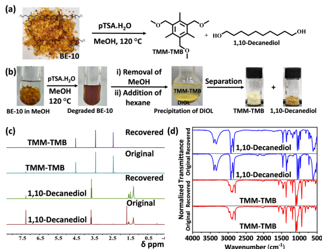
Fig. 3 (a) Scheme of BE-10 degradation using methanol. (b) Pictorial representation of the degradation of BE-10 and the recovery of the monomers, (c) 1 H NMR and (d) FT-IR comparison of the original and recovered monomers.