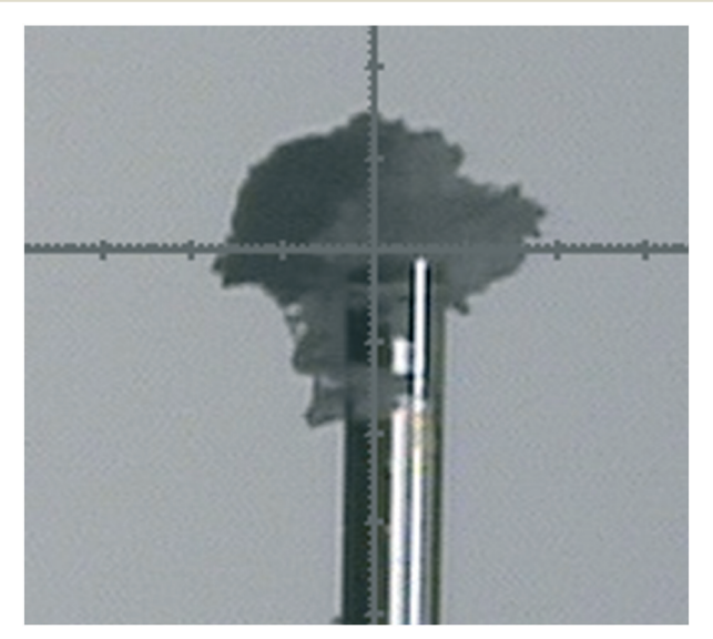
Fig. 1 A very small amount of powder (ca. 0.01 mg) mounted on the top of a glass fibre in the single crystal X-ray diffractometer. Each major tick represents 0.1 mm.

Of the 15 materials studied, 14 (Table 1) were solved to a high degree of accuracy using DASH. Only γ-carbamazepine