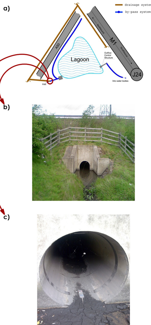
Fig. 2 Inlet: (a) schematic view of the SuDS lagoon with the inlet (circled); (b) view of the inlet when it is filled with water; (c) view of the inlet with the flow meter during dry weather.

To measure the discharge from the motorway catchment into the inlet (Fig. 2b), a "STARFLOW" Ultrasonic Doppler Instrument ( Starflow Model 6526B ) was used. The instrument measures water velocity, depth and temperature integrated into a single unit. Water velocity is measured acoustically by recording the Doppler shift from particles and air bubbles carried in the water. Water depth is measured by a pressure transducer which records the hydrostatic pressure of the water above the instrument. Temperature is measured in order to refine the acoustic recordings, which are affected by the temperature. The STARFLOW was installed in the inlet pipe with a diameter of 1000 mm (Fig. 2c) near the