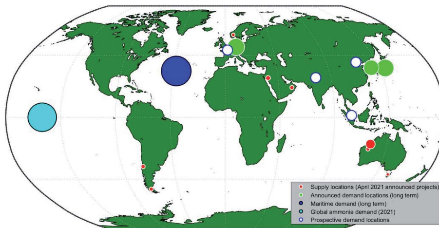
Fig. 5 Summary of announced ammonia supply and prospective demand. Filled bubble size is proportional to scale; locations without publicly announced import policies are not to scale and are shown as empty bubbles. Where demand is specified by mass of hydrogen, it is converted to ammonia mass using the HHV.

Overall, there is significant demand for imported hydrogen and ammonia as a driver for decarbonisation in some of the world's largest economies. In the medium term, green fuel demand is capped by cost, as it is competing against grey hydrogen. In the longer term, demand is capped by energy consumption, although the consumption of the shipping industry alone could be very large. Fig. 5 summarises the ammonia demand in the countries listed in Table 10, compared to the size of the announced projects listed in Table 9. At present, supply is much less than the prospective demand, although the demand shown will not manifest until the middle of the century.