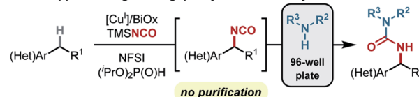
Fig. 1 Copper-catalyzed benzylic C(sp 3 )–H isocyanation/amine coupling. (A) Drug candidates embedding benzylic urea. (B) Two possible one-pot synthetic approaches toward ureas from benzylic C–H substrates. (C) Strategy for high-throughput synthesis of ureas. NFSI, N -fluorobenzenesulfonimide; BiOx, 2,2′-bis(oxazoline); TMSNCO, (trimethylsilyl)isocyanate.