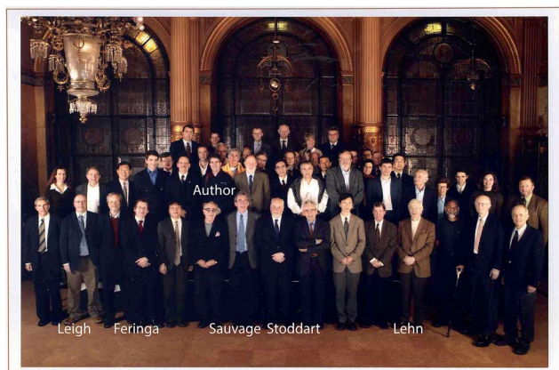
Fig. 4 Participants of the 21 st Solvay Conference on Chemistry "From Noncovalent Assemblies to Molecular Machines", Brussels, Hotel Métropole, 30 November 2007.