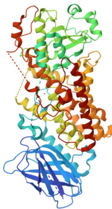
Fig. 3 3D structure of 5-lipoxygenase (5-LOX) obtained from protein data bank (PDB: 7TTJ).

The molecular docking simulation of the most active azomethine salicylic acid derivatives 2, 4, and 9 was conducted inside the active site of 5-lipoxygenase (PDB: 7TTJ) ( https://www.rcsb.org/structure/7TTJ ; last access 1/10/2025) (Fig. 3). The docking simulation results of the designed derivatives were