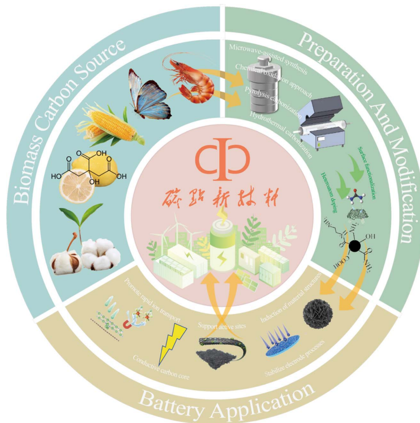
Fig. 2 Overview of BCDs: from biomass carbon sources to battery applications.

resulted in carbon dots with markedly different properties. Thus, relying solely on organisms as carbon sources may pose challenges in achieving the desired carbon dot products. There might be opportunities for further exploration in understanding biomass components and optimizing purification processes. Furthermore, the relatively low content of active substances capable of participating in reactions within natural organisms may limit the efficiency of carbon dot production. Although the abundance of raw materials can offset this limitation, it remains a crucial consideration in the carbon source selection process. Opting for relatively pure biological components like glucose, citric acid (CA), or cellulose as raw materials can mitigate some stability concerns but may elevate production costs.