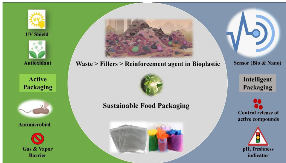
Fig. 2 Improved characteristics of waste-derived fillers incorporated bioplastic [the image is created by the 1st author Zeba Tabassum; information is obtained from ref. 18 and 19].

livestock and crop production. This increase has, in turn, contributed to the substantial generation of agricultural waste. Over the last century, regions such as China, India, and Africa have not only witnessed rapid population and economic growth but also a significant increase in agricultural waste production. Each year, India generates a large amount of solid waste, with agricultural waste being the most significant, ranging from approximately 350 to 990 million tonnes per year. 23