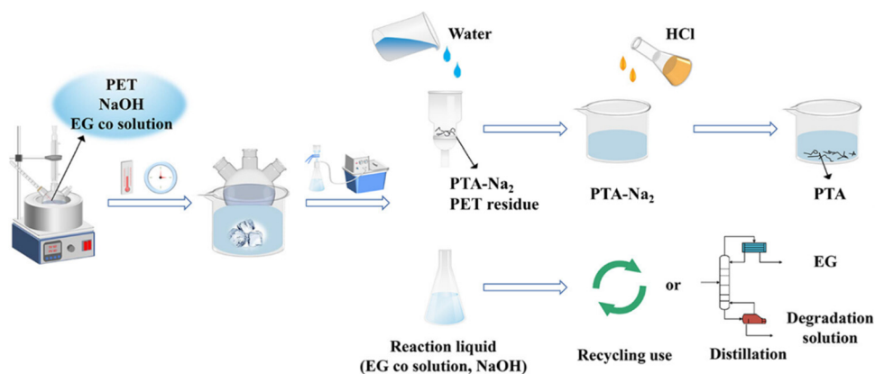
Fig. 4 Experimental procedure of PET alkaline hydrolysis.

Glycolysis refers to the reaction of polyesters in a diol solution (such as EG, DEG, propylene glycol, etc. ) to produce monomers that contain terminal hydroxyl groups. The glycolysis reaction routes of PET, PEF and PLA in EG or DEG are shown in Fig. 5.