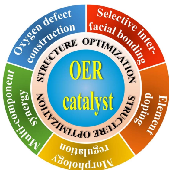
Fig. 3 The summary of design strategies for further enhancing the OER catalyst activity.

Recently, other strategies such as heteroatom incorporation, in situ activation and precursor regulation have also been demonstrated to construct oxygen defects in OER catalysts for further promoting the PEC water splitting activity. For instance, Wang et al. reported a two-step photo-assisted electrodeposition