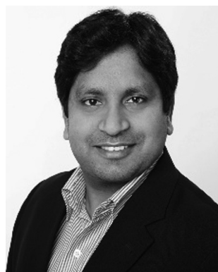
Yogendra Kumar Mishra

The nano-carbons are composed of covalently bonded carbon atoms with different hybridization states ( sp , sp^2 , sp^3 ), which deliver a huge diversity in morphology and structures. Mainly, they include fullerene, graphene, carbon-nitride, carbon-dots (CDs), carbon nanotubes (CNTs), carbon nanorods (CNRs), carbon nanowires, graphene nanoribbons (GNRs), and carbon quantum dots (CQDs). The exceptional properties and versatile physiochemical characteristics of nano-carbons provide opportunities for the immense development of enzyme mimetic applications. 1 These nanozymes have various applications in the field of bio-sensing, biocatalysis, biofuel cells, heavy metal detection, environment monitoring and remediation, medicine, antibacterial, antifungal treatment, and others. 8,20,23 Up to now, doping, surface functionalization, structural defects, size, and shape engineering of nano-carbons are the main strategies for tuning their \pi -system to achieve good performance as nanozymes. 8 The nano-carbons-based nanozymes can also act as photocatalysts, which can harvest solar energy for photocatalytic reactions. 28 For future