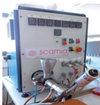
Fig. 7 Representation of a single-screw extruder.