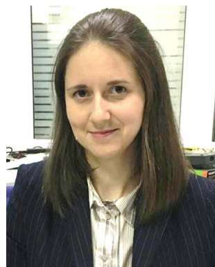
Anastasiia D. Vlasova

† Electronic supplementary information (ESI) available. See DOI: https://doi.org/10.1039/d3cs00699a