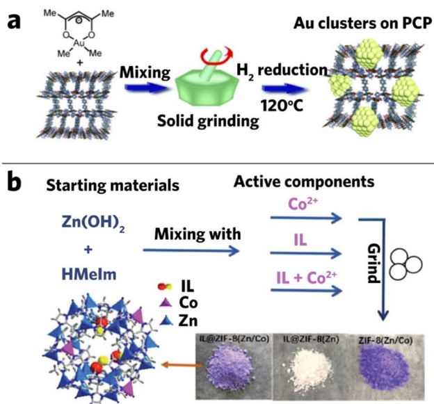
Fig. 10 (a) Mechanochemical deposition of gold clusters on porous coordination polymers. Reproduced with permission from ref. 100, (b) synthetic procedures of L@ZIF-8(Zn/Co). Reproduced with permission from ref. 133.

Due to unique porosity and functional groups, MOF itself has already been employed as a great candidate for adsorption, including gas adsorption, 134 water treatment, 135,136 and specific ion adsorption. 137 The integration of MOFs with other porous materials has demonstrated great potential in increasing their adsorption ability compared with the parent materials. 138,139–142 Compared to traditional methods such as solvothermal method, larger surface area, better porosity,