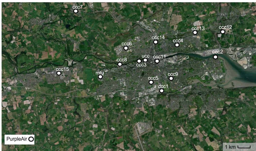
Fig. 1 Map of Cork city with PA locations.

is available freely via the PurpleAir website ( https://map.purpleair.com/ ).