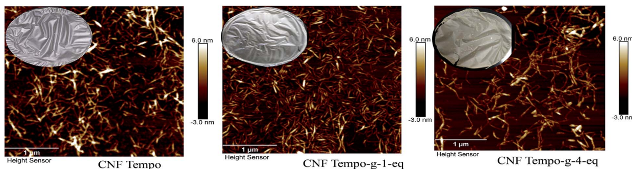
Fig. 5 AFM pictures of CNF Tempo, CNF Tempo-g-1-eq. and CNF Tempo-g-4eq. with films after grafting on the surface of cellulose (conc. 0.1%, tapping mode in air, area 3.3 \times 3.3 \mu\text{m}^2 ).

Degradation of TEMPO cellulose fibers starts at 200 °C under nitrogen while with the conventional cellulose, its decomposition start at 300 °C. The initial decreases in weight observed at about 60–100 °C in the reference TEMPO CNF is a consequence of the loss of the residual moisture. But, this depression in weight for residual moisture is slightly lower in the grafted samples stating the presence of less moisture comparatively after grafting which is classical for all grafting procedures. 52 As already shown in previous literature, small modification might prove indirectly the grafting. Indeed it is well-known that nanocellulose grafting with large molecule like