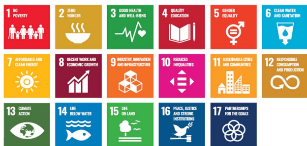
Fig. 1 The 2030 United Nations sustainable development goals.