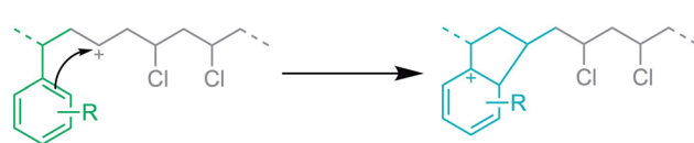
Fig. 2 Proposed intramolecular Friedel–Crafts alkylation leading to formation of polyindene segments.

DSC studies of the polymers produced with different arenes at different temperatures were measured (Fig. 3). While the ratios of hydrodechlorination to Friedel–Crafts alkylation did not seem to be changing, the difference between intramolecular and intermolecular Friedel–Crafts alkylation would be expected to be thermally dependent. In the case of toluene, the T_g of the material increases from 74 to 109 °C as the reaction temperature decreases from 110 to 25 °C, suggesting more polyindene formation at lower temperatures (Fig. 3a). This would be expected, as intramolecular reactions should be favored more at low temperature than the intermolecular hydrodechlorination or Friedel–Crafts alkylation. When shifting to benzene, the change in T_g is much more pronounced across the different reaction temperatures (74 to 124 °C) with