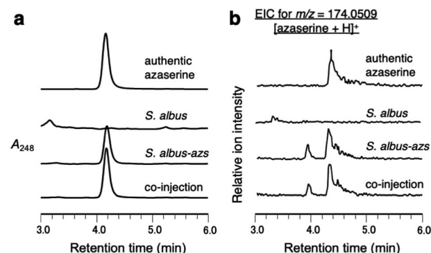
Fig. 2 Heterologous expression of the azs cluster in S. albus . (a) LC analysis of metabolites produced by S. albus-azs . UV chromatograms extracted at 248 nm. (b) LC-HRMS analysis of metabolites produced by S. albus-azs . Extracted ion chromatograms of m/z 174.0509, corresponding to [M + H]^+ ion of azaserine.

We performed in vitro analysis of enzymes that were predicted to be involved in the reactions after HAA synthesis using