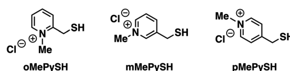
Fig. 2 Molecular structures of oPySH, mPySH, and pPySH as pro-methylated forms and oMePySH, mMePySH, and pMePySH as methylated forms.