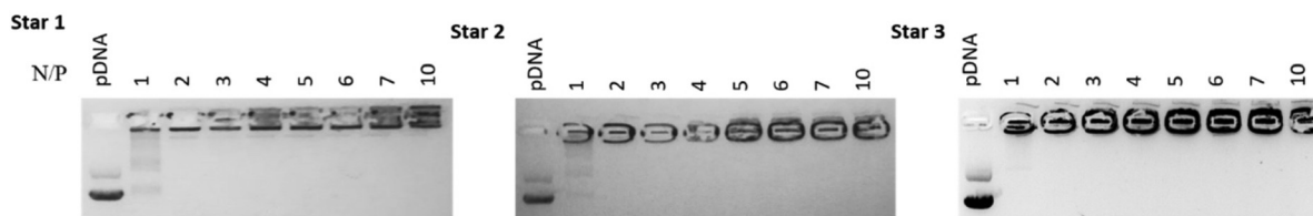
Fig. 6 Agarose gel electrophoresis pictures of complexation of pDNA with Star 1, 2 and 3 at N/P ratios of 0, 1, 2, 3, 4, 5, 6, 7 and 10.