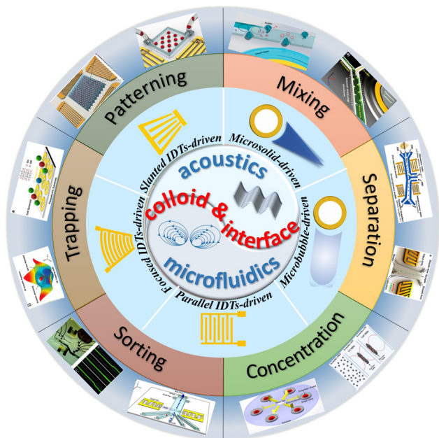
Fig. 1 Acoustic microfluidics for colloidal materials and interface engineering enabled by the functions of mixing, separation, concentration, sorting, trapping, and patterning. Reproduced with permissions from ref. 24, 32, 38, 48 and 50–57, respectively.

and aluminum nitride). BAW microfluidics that usually work under a frequency of several hertz to a few hundred kilohertz can be further divided into microsolid-driven microfluidics and microbubble-driven microfluidics (Fig. 2a). Microsolid-driven microfluidics relies on the oscillation of solid microstructures (mostly triangular objects) inside the microchannels upon acoustic actuation, which can induce a pair of counter-rotating vortices