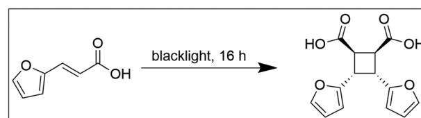
Fig. 1 Scheme of CBDA-2 synthesis from furfural derived trans -3-(2-furyl)acrylic acid.

As an epoxy, we chose epoxidized linseed oil (ELO), a green epoxy matrix with high epoxy units content relative to other natural oils. 16 From previous investigations, 20,34 we know that the highest enthalpy release is observed when a ratio of 0.8 epoxy groups to COOH groups is used. The molecular weight and epoxy group content of ELO was calculated by NMR (spectra in Fig. S2†), and the appropriate amount of CBDA-2 was calculated accordingly (details in the Experimental section). After thorough mixing of ELO and CBDA-2 for a couple of minutes, a brown slush forms (Fig. S3†), which can be poured into a negative mold with the desired shape. The curing behavior of the ELO/CBDA-2 mixture was initially investigated using DSC measurements. A dynamic DSC scan (Fig. S4†) revealed that the reaction starts at around 90 °C, with a peak of DSC heat flow observed at 136 °C, which is proportional to the reaction rate. Furthermore, we observe a T_g of 19 °C for the cured material.