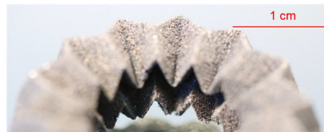
Fig. 1 Printed PM of novel shape with cooling channel.

LPBF is a manufacturing process that employs a high-powered laser to selectively fuse, or sinter powdered materials, typically metals or alloys, layer by layer. The process involves spreading a thin layer of powder evenly on the build platform and then selectively fusing the powder particles by applying laser energy in a specific pattern to form a solid layer. The build platform will then descend by one-layer thickness, and this process is iterated to progressively construct the final part. 5