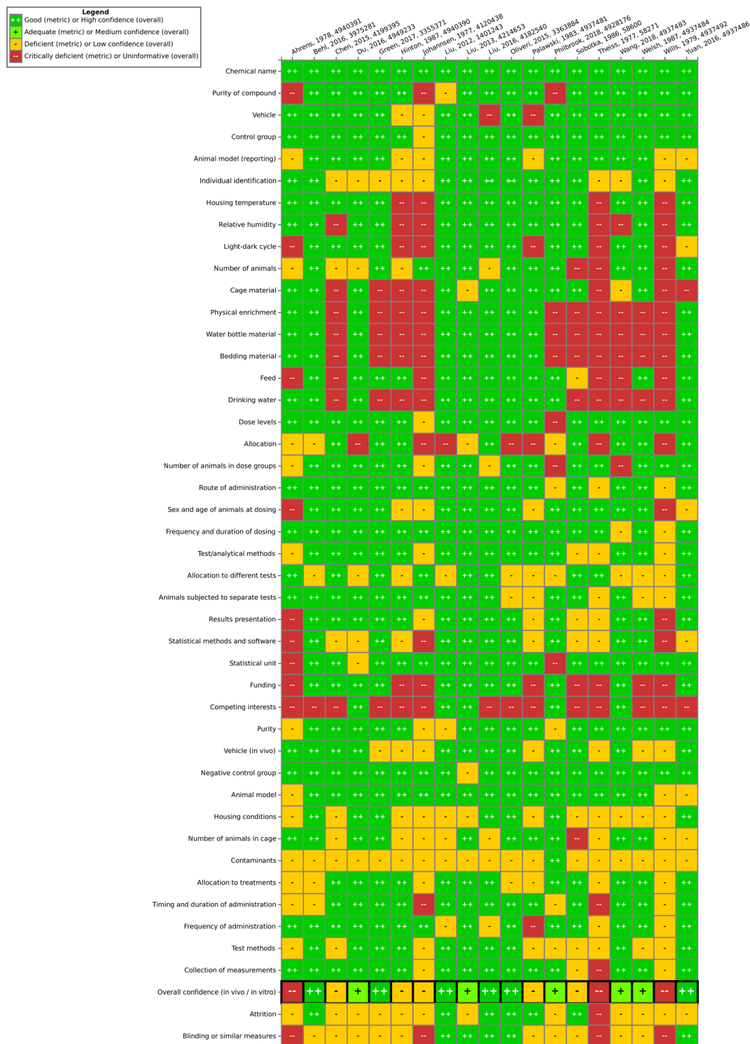
Fig. 4 Study evaluation results for in vivo studies using the SciRAP tool. "Good" corresponds to "fulfilled", "deficient" corresponds to "partially fulfilled" and "critically deficient" corresponds to "not fulfilled". Expert judgment was utilized to arrive at the overall confidence, taking into consideration the number of certain ratings as well as the importance of a specific criterion. This figure can also be found at https://hawcprd.epa.gov/summary/visual/100500019/ .

In total, we rated 19 studies as having high confidence, 25 as having medium confidence, 16 as having low confidence and