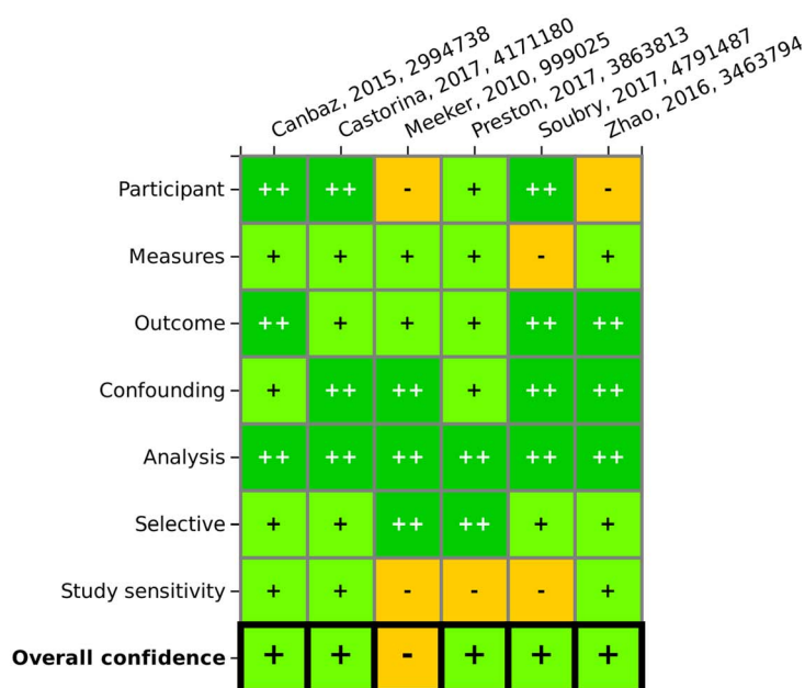
Fig. 6 Study evaluation results for epidemiological studies using the IRIS tool. Expert judgment was utilized to arrive at the overall confidence, taking into consideration the number of certain ratings as well as the importance of a specific criterion. This figure can also be found at https://hawcprd.epa.gov/summary/visual/100500039/ .

3.5.1 Human, wildlife and experimental in vivo data relevant for the assessment of adverse effects. Table 3 shows the evidence ratings for adverse effects for the different outcome groups “human” as well as “experimental in vivo data for mammals”. Where no data for an outcome group was found for human/wildlife or in vivo data, this was marked as “no data”. Data not showing significant effects were marked “no evidence for effect” with its final confidence rating from the previous step after down/upgrading considerations in brackets. It should be noted that “no evidence for effect” should only be seen in the context of this assessment as proving a negative in general is not possible.