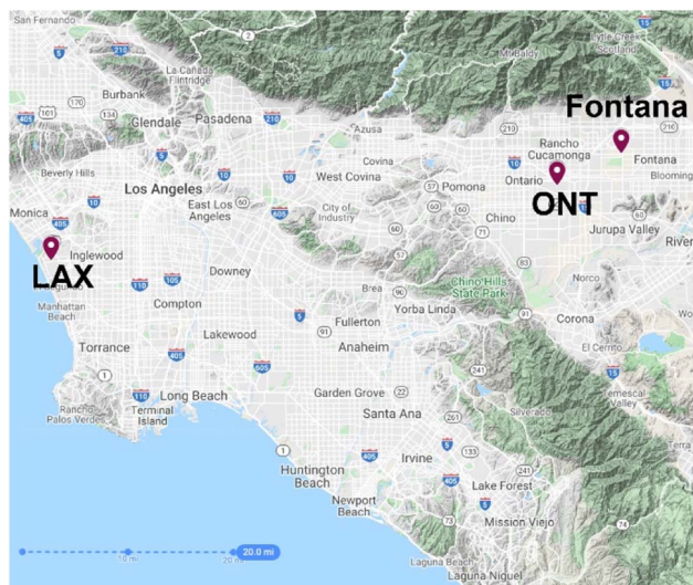
Fig. 1 Site location map highlighting the Los Angeles (LAX) and Ontario (ONT) International Airports and the Fontana air monitoring site.

LAX's annual average temperature was 1.0 °C lower than ONT (17.9 °C for LAX and 18.9 °C for ONT). During the 2010 to 2019 period, the 8 hour ozone design value concentration for LAX fluctuated around 80 ppb, whereas the value for Fontana was consistently above 100 ppb (Fig. S1 and S2†).