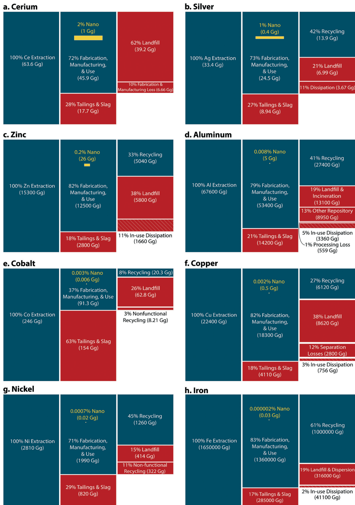
Fig. 4 Global material efficiencies across one life cycle of the particular element, from extraction of ore to end-of-life (left to right): production, fabrication, manufacturing, and use, and waste management/end-of-life. Red: losses from the anthropogenic cycle, where striped areas are losses during the use phase; blue: flows of metal to the anthropogenic cycle; yellow: engineered nanomaterial. Areas of rectangles reflect the magnitude of material flows as the percent of extracted ore in Gg of metal content, based on 2014 production volumes. Nanomaterial flows are based on high production volume estimates for 2014. All masses are in metal content of the particular element. All masses are rounded to 3 significant digits with the exception of nanomaterial flows. A glossary of terms is provided in the ESI† Table S1.