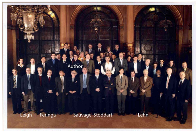
21st Solvay Conference on Chemistry - «From Noncovalent Assemblies to Molecular Machines» - Brussels, Hotel Métropole, 30 November 2007