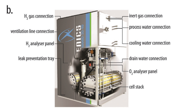
Fig. 1 (a) A schematic illustration of a simple U-tube configuration for water electrolysis. Voltage penalties (overpotentials) increase the total voltage required to operate the system at a given rate relative to the thermodynamically required potential, and include the kinetic overpotentials associated with the hydrogen-evolution and oxygen-evolution reactions (\eta_{\text{HER}} \text{ and } \eta_{\text{OER}}, \text{ respectively}), \text{ the concentration overpotential } (\eta_{\text{con}}), \text{ and } ohmic resistance loss ( \eta_{\text{ohm}} ). The total operating voltage of the system is given by the sum of the thermodynamic voltage for the water-splitting reaction and the total overpotential, \eta_{\text{total}} , for the system. (b) A schematic illustration of a commercially available (Hydrogenics) alkaline water electrolyzer with auxiliary components.7

\eta_{\text{total}} = \eta_{\text{HER}} + \eta_{\text{OER}} + \eta_{\text{ohm}} + \eta_{\text{con}}