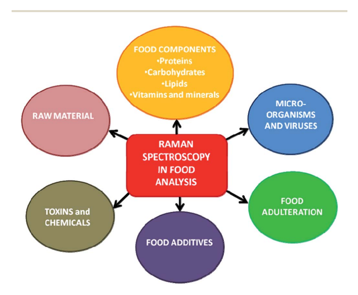
Fig. 2 Schematic presentation of fields in food analysis in which Raman spectroscopy used.

liquid and solid phases at ambient temperature and pressure.<sup>8</sup> Besides, Raman spectroscopy is a potential tool for the assessment of food quality systems during handling, processing and storage.<sup>9</sup>