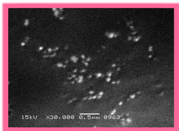
Fig. 21 SEM microphotograph of diclofenac -capped silver NPs ( 1a ) obtained by direct reaction of silver I nitrate and dh (molar ratio 1:2) in methanol upon stirring at 45 °C.

( 1a ). The supernatant after separating 1a produced low-quality (somewhat porous) TRFs of silver on plastic or glass containers upon storage for a few days (Fig. 20b and c), with inadequate co-crystallization of complex 1 . Product 1a was later characterized as well-dispersed spherical silver nanoclusters of size below 100 nm (by SEM, Fig. 21), capped by diclofenac acid, the oxidized carboxylic acid end-product of dh (verified by FT-IR, 1 H NMR, 13 C{ 1 H} NMR, and EI-MS spectra, ESI,† Fig. S19–S22).