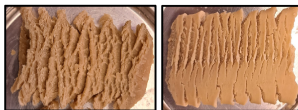
Fig. 2 Images of the extruded analogues at a water flow of 2.64 L \text{h}^{-1} .

Preliminary tests were carried out to find the extrusion conditions that would provide a distinct fibrous structure. Various water flows were used and the resulting samples were evaluated. It was observed that when the flow rate was 2.64 L \text{h}^{-1} , the result was a very hard material, difficult to handle and almost petrified, as can be seen in Fig. 2. When this flow rate increased to 3.5 L \text{h}^{-1} the material was fragile and very sticky (Fig. 3), due to excessive hydration. It was concluded that an adequate water flow should be between 2.64 and 3.5 L \text{h}^{-1} , so it was decided to use a water flow of 3 L \text{h}^{-1} , with which an adequate texture was