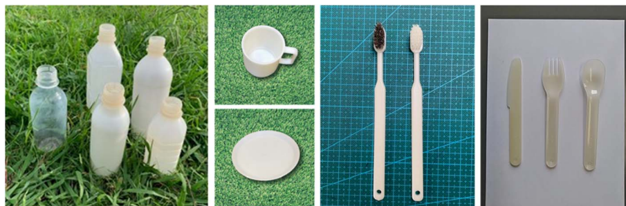
Fig. 11 From (Left), bottle, cup, tray, toothbrush, and cutlery, all with 100% biomass biodegradable plastic composition. Brush part of tooth brush (Left) is made of natural brush although toothbrush (Right) is made of petroleum-derived plastic. 59

In addition, nanocellulose has a low coefficient of thermal expansion and does not expand, extend or change its shape