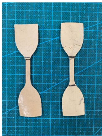
Fig. 33 Dumbbell test piece of (Left) natural rubber and (Right) natural rubber nano cellulose composite material. 180