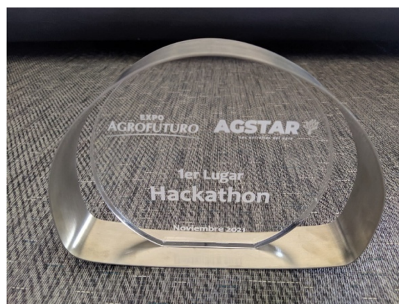
Fig. 2 “Hackathon AGSTAR 2021” price.

Some representative projects demonstrate how green chemistry principles have been implemented in educational