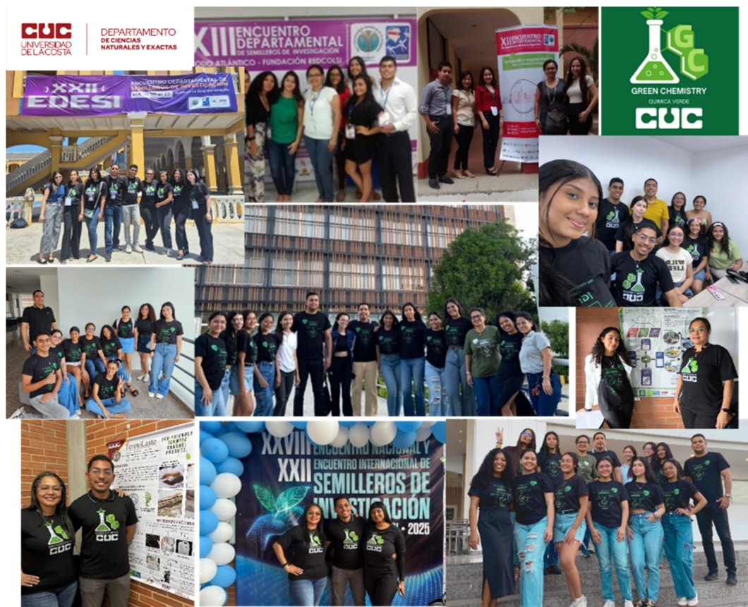
Fig. 1 Green chemistry research hotbed – a decade.

development of the research process, including proposal formulation, methodological design, experimental implementation, data analysis, and preparation of the final report, ensuring academic and methodological rigor. The students present their final work before a jury evaluator. The jury evaluators are faculty members from the Environmental Engineering program whose academic experience and thematic expertise are aligned with the project topic. They are responsible for assessing the written final report and the oral defense based on previously established evaluation criteria. The students have the autonomy to decide on the focus of their work, and the tutors play the role of an expert guide throughout the process, providing guidance and assistance as needed.