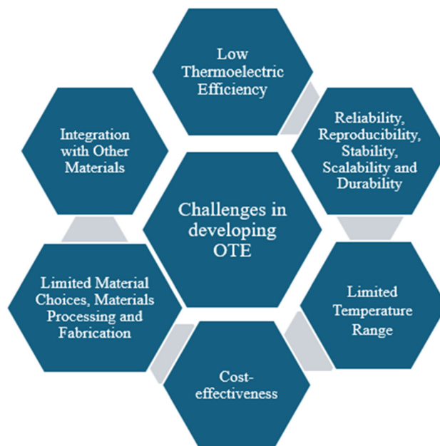
Fig. 12 Key challenges in developing OTE materials.

Graphene-based materials are becoming increasingly popular in the TE industry owing to their superior electrical transport, thermal stability, and mechanical properties. Graphene