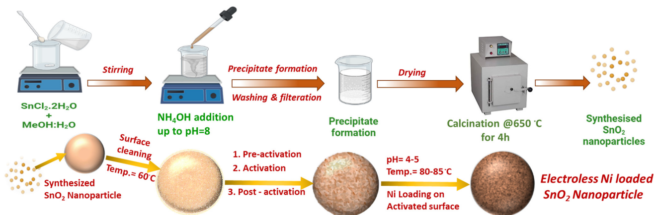
Fig. 1 Process schematic for the synthesis of SnO 2 nanoparticles and their electroless loading with Ni.

An IRAffinity-1S 01130 Shimadzu spectrometer was exploited for measuring Fourier transform infrared (FTIR) spectra between 400 and 4000 cm -1 . Morphological and microstructural investigations were performed using field emission scanning electron microscopy (FESEM, FEI NOVA NANOSEM 450) and field emission transmission electron microscopy (FETEM by JEOL, JEM-2200FS). For typical FETEM analysis, the test sample was carefully prepared by dispersing the sample powder in ethanol and then drop-casting it onto a carbon-coated grid. To obtain high imaging and spatial resolution with chemical mapping of the material, scanning trans-