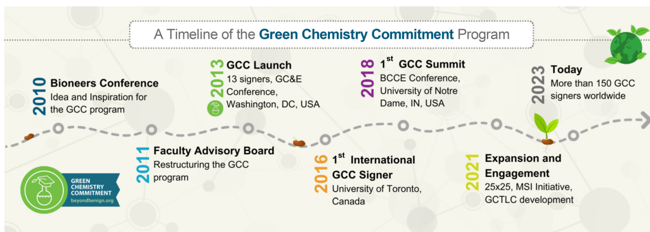
Fig. 1 A timeline of the Green Chemistry Commitment (GCC) program, which is composed of more than 150 higher education institutions worldwide as of December 31, 2023.

For the 25 × 25 Initiative, a combined total of $55 000 USD (37% of total GCC grant funding) has been awarded to 8 institutions in the U.S. to drive awareness and improve the adoption of green chemistry locally and internationally, and these numbers continue to grow. 34–36 The first Green Chemistry Challenge Award winners ( i.e. , Michigan State University; University of California, Berkeley; Southern University and Agricultural & Mechanical College) proposed the design of more than 10 teaching resources, thus helping to bring green