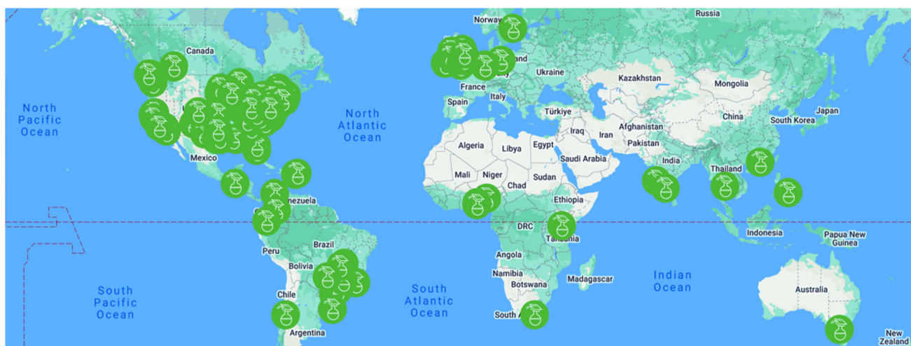
Fig. 3 Worldwide distribution of institutions participating in the GCC program. More than 150 GCC signers are based in over 15 countries, with communities outside of the U.S. representing 30% of the total number of participating institutions as of December 31, 2023.

By including green chemistry in higher education, our society can ensure that our scientists are trained in the most responsible way to assess and design molecular species that are inherently safer for themselves and their communities. Many companies worldwide have established diverse sustainability strategies, which require chemists with skills to address the environmental and societal impacts of the processes and products created. 49–54 In fact, the growth in demand for green skills (22.4%) already surpassed the share of green talent in the workforce (12.3%) between 2022 and 2023, and this