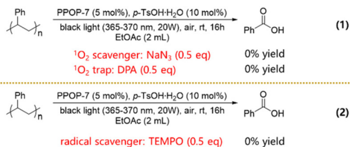
Scheme 2 Controlled experiments.

that the radical also contributed to the degradation of PS (Scheme 2, eqn (2)).