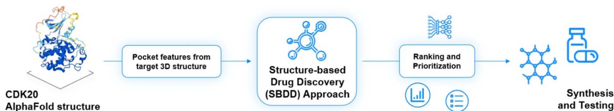
Fig. 3 Insilico Medicine generative procedures for CDK20 hits.

After uploading a protein structure to the Chemistry42 platform, the built-in energy-based approach is automatically used in order to determine putative binding sites. The surface of the protein is evenly covered with probes (methyl), and the energy of non-covalent interactions with the receptor atoms is calculated for each probe. Probes having energy lower than a user-defined threshold are clustered into separate pockets. Each identified cavity is scored using pocket volume, surface, and depth descriptors. Based on these descriptors, Chemistry42 provides a list of identified binding sites.