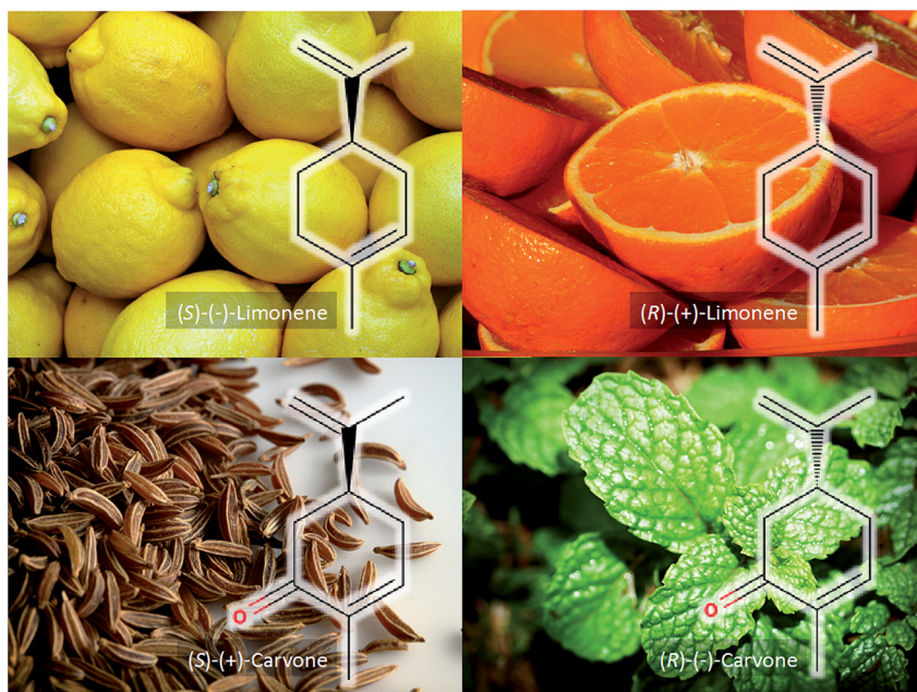
Fig. 2 The chiral limonene monoterpenes that give lemons and oranges their characteristic smell and flavour. Also shown are the two chiral forms of carvone that are responsible for the distinct smell and taste of caraway and spearmint. The images are under a free Pixabay license ( https://pixabay.com ). The chemical structures were generated in MolView ( http://molview.org/ ).

found in oranges and is responsible for their aroma. 5 The simple addition of a carbonyl group to the benzene ring of limonene gives rise to either the mint or caraway aroma and the flavour from ( R )-(-)-carvone or ( S )-(+)-carvone, respectively. 6 These four very simple monoterpenes give highly diverse flavours and this highlights the importance of chirality in molecules, and in particular the interaction of such molecules with our taste receptors.