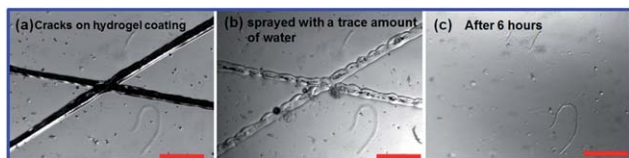
Fig. 5 The use of a dried self-healing hydrogel film as a protective coating. (a) A hydrogel coating with a crack of about 100 \mu m on a glass surface. (b) The hydrogel was sprayed with a trace amount of water. (c) The cracks self-healed completely after 6 hours. The scale bar is 500 \mu m .

drastically with the increase of [MBAA]. We presume that this can be explained by (i) a slow diffusion of metal ions at high cross-linking density of the hydrogel, and (ii) a reduced mobility