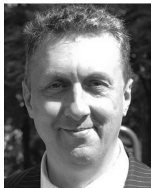
Achim Walter Hassel

development has gained significant interest, due to their potential applications in fields such as neuromorphic computing, 3 artificial intelligence, 4 and data storage. 5 Within this broad field, anodic memristors are relevantly new devices, whose oxides are grown by electrochemical anodization of a valve metal, rather than by using vacuum techniques, such as sputtering and atomic layer deposition (ALD). One of the first anodic memristors was reported in 2010 by Miller et al. , whose devices showed bipolar memristive switching in thin TiO 2 . 6 Building on these studies, many research groups have since explored anodization parameters in order to optimize anodic memristive devices and materials. This is done by varying the oxide thickness, electrolyte composition, applied voltage, time, and temperature to tune switching voltages, ON/OFF ratios,