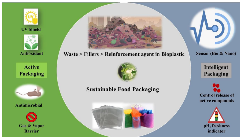
Fig. 2 Improved characteristics of waste-derived fillers incorporated bioplastic [the image is created by the 1st author Zeba Tabassum; information is obtained from ref. 18 and 19].

livestock and crop production. This increase has, in turn, contributed to the substantial generation of agricultural waste. Over the last century, regions such as China, India, and Africa have not only witnessed rapid population and economic growth but also a significant increase in agricultural waste production. Each year, India generates a large amount of solid waste, with agricultural waste being the most significant, ranging from approximately 350 to 990 million tonnes per year. 23