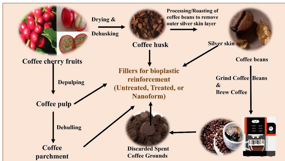
Fig. 8 Various coffee processing byproducts in the production of fillers [image created by the first author, Zeba Tabassum, utilizing data from ref. 55–58].

Fourier-transform infrared spectroscopy results confirmed the successful integration of coffee waste into the film matrix, as evidenced by the presence of an N–H bond. Incorporating coffee filler also improved the film's hydrophobicity, as indicated by an increased water contact angle compared to the neat film. The tensile properties of the biopolymer film were notably enhanced with the addition of 4 wt% coffee powder, achieving an optimum tensile strength of 35.47 MPa. The inclusion of coffee waste in the seaweed matrix resulted in improved functional properties of the fabricated biopolymer film. Therefore, the researchers concluded that the seaweed/coffee biopolymer film has the potential for use in food packaging and various other applications. 60